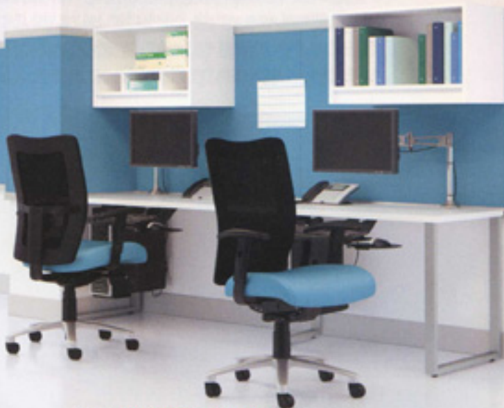
Exhibit by National Office Furniture removes barriers and transforms walls into purposeful design elements offering a variety of solutions for all workplace, collaborative and social environments. Its efficient use of wall space and various inserts, such as slat walls and work tools, marker boards and tack boards, serve as an organizational coach, brainstormer or impromptu art gallery. Exhibit creates a lighter, airier aesthetic while providing easy access to electrical and data.

Inspired by the natural stone from which it derives its name, Bluestone by Crossville features a field of soft earthen tones, enhanced by fossil-like impressions and the subtle pearlescence of embedded shells. In both natural and semi-polished finishes, it imparts a classic elegance to any space. Bluestone contains a minimum of 20 percent recycled content, and is available in four colorways and a variety of sizes.